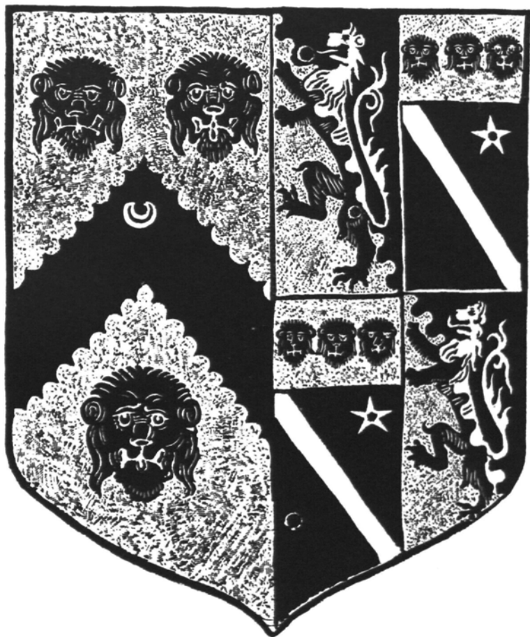
FIG. 2. NONINGTON, KENT. Shield in brass. 1581. Wilsford impaling Simpson.